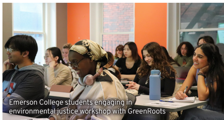
Emerson College students engaging in environmental justice workshop with GreenRoots